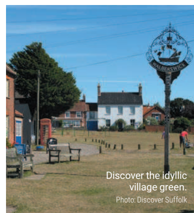
Discover the idyllic village green.

Note: When the ferry is not running, it is possible to do a similar walk by keeping to the Walberswick side of the River Blyth instead of crossing the river on the Bailey Bridge. On leaving the ferry, turn left. You soon reach Ferry Road, which runs between the two car parking areas. Keep walking along Ferry Road; it takes you back into the village and the green.