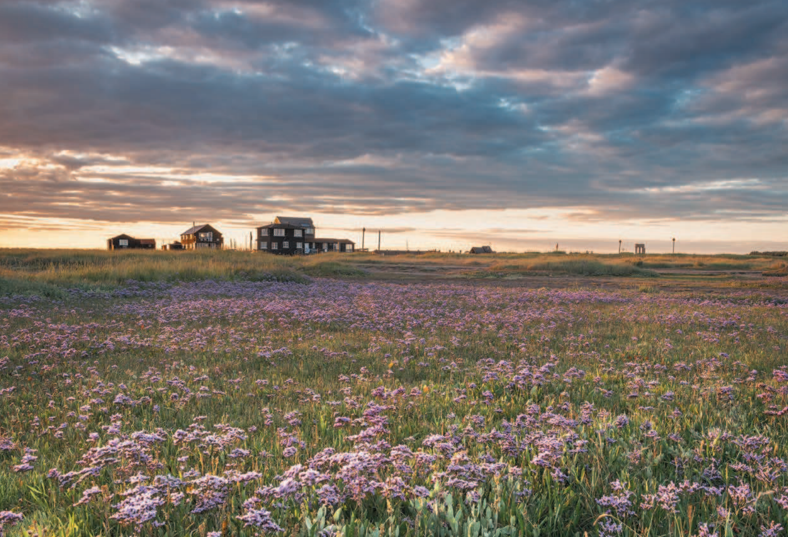
The coastal village of Walberswick.