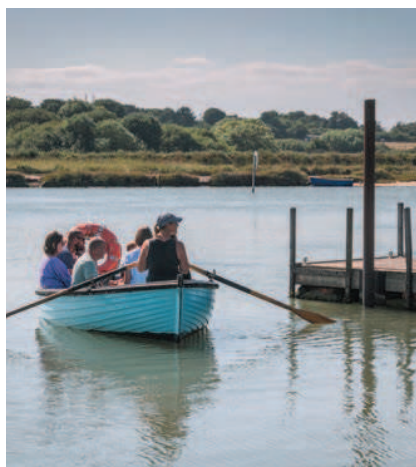
Hop aboard the ferry.

In 1328, a severe storm destroyed much of the ancient port of nearby Dunwich and the River Dunwich then forged a new path to the sea via Walberswick. Walberswick became a centre for fishing and shipbuilding, but its fortunes varied.