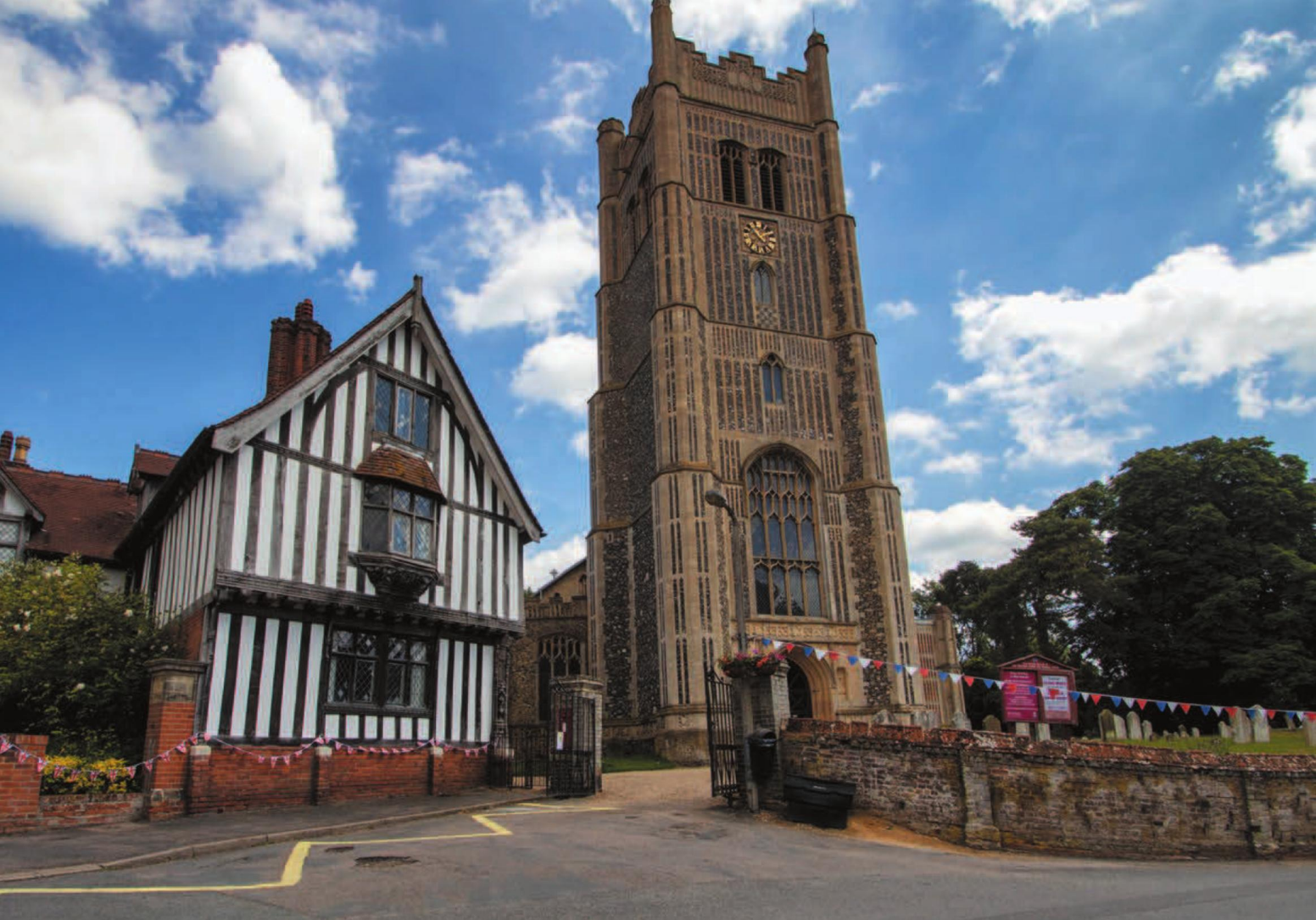
Discover the small market town of Eye.