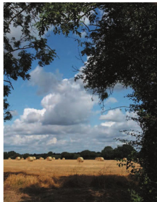
above: Enjoy the countryside between these two locations.

6 Turn right down the slope towards Oakley Park, the site of the old Hoxne Hall, once the Bishop's Palace where Bishop Lyhart of Norwich died in 1472. His coat of arms can be seen on Hoxne church font. Cross the bridge and turn left through the poplar trees and up the slope to arrive at Eye Road. You are now close to the spot where a metal detector discovered the fabulous Hoxne Hoard of priceless Roman treasure in 1992. Turn left and after 400 metres, turn left into the Low Street with the 16th century Swan pub on your left. Just after the post office, turn right into Church Hill to emerge opposite the church. Return by the same route.