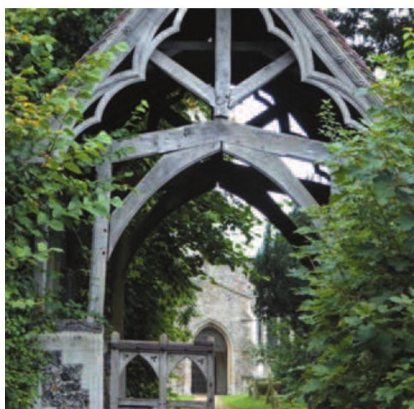
Pretty gate at Hoxne church.

The soaring church tower of St Peter and St Paul in Eye, with its sublime flint flushwork, is one of the wonders of Suffolk. Largely built during the 15th century, this beautiful and lofty building has a glorious medieval chancel screen painted with the figures of saints. The 20th century rood loft and rood above are by Sir Ninian Comper and surmounted by a richly decorated canopy of honour.